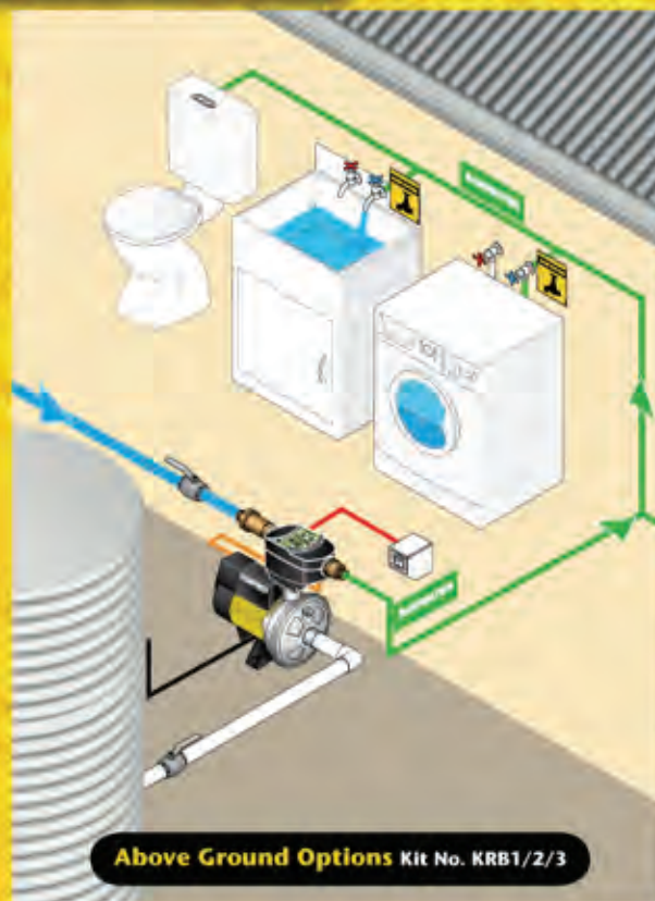
Above Ground Options Kit No. KRB1/2/3